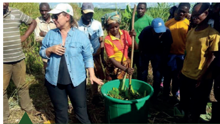
Training of the process of composting organic materials and its use for the preparation of natural fertilizers.

contributing to the supply of the domestic market with quality products (without the use of chemicals) and food security, besides the generation of employment / income, strengthening the family agriculture and the regional economy.