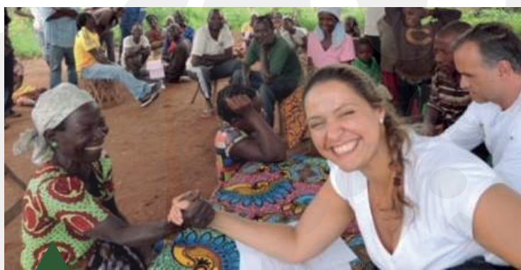
Chipembe Farm producers in an interview with Pro Natura.

Executive Officer of the Family Agriculture Development Program in Mozambique - Chipembe Farm Pilot - Cabo Delgado