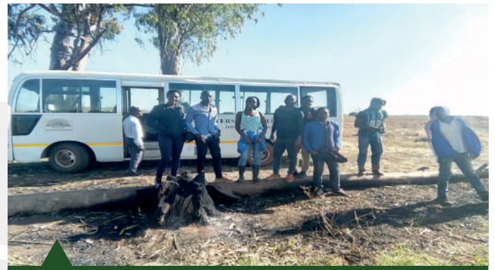
Agronomy students of the Pedagogical University on a technical visit in Farm Chipembe.

partnership with the Pedagogical University (UP) based in Montepuez to fund 10 student scholarships to measure and evaluate the impacts generated by the project in the territory chosen. All the students are from the agronomy course, have received training from PNI, and are being supervised by teachers to collect the necessary data and measure the evolution of the project.