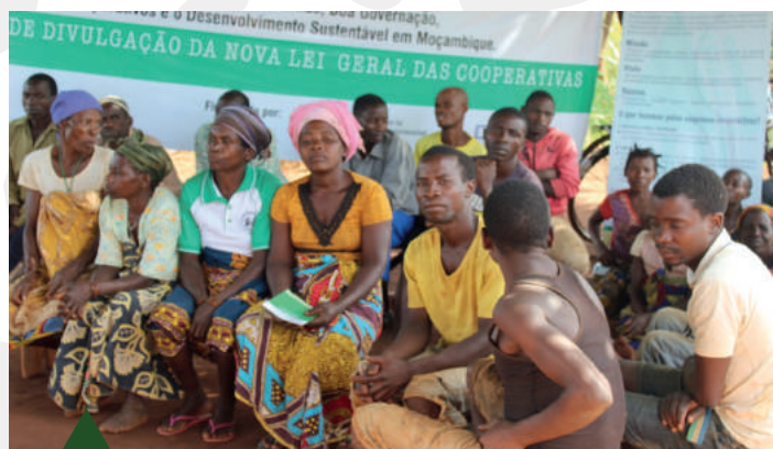
Training on the foundations of modern cooperativism and good governance in cooperative enterprises.

In July 2018 the Chipembe Irrigation Producers Cooperative - COOPAREC, Limited was created. The General Shareholders' Meeting was held and the corporate bodies were elected, as well as the articles of association that were duly recognized in the local Conservatory.