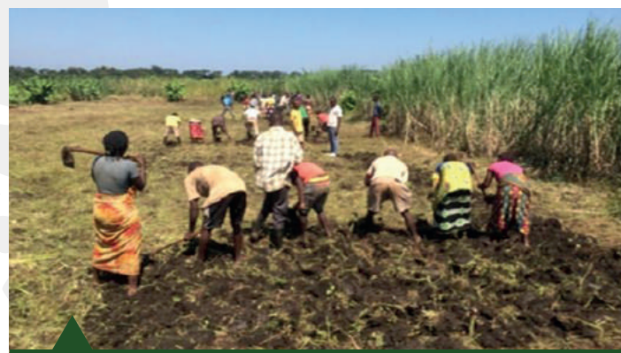
Preparation of the pilot project area and the implementation of the basic production module.