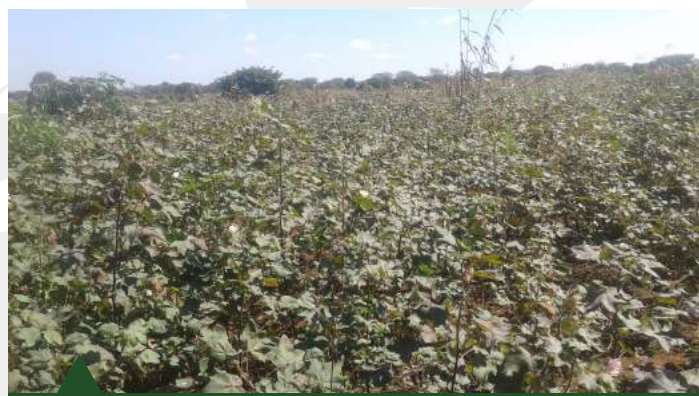
Cotton Field at Chipembe Farm