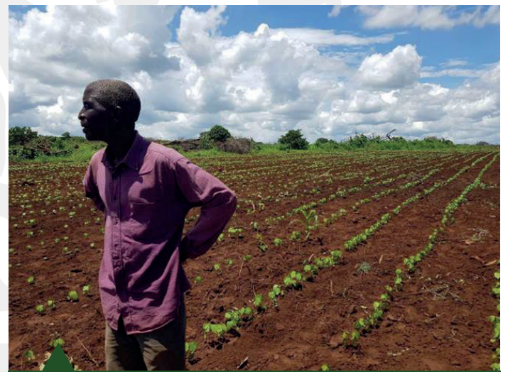
Cotton farming at Chipembe Farm.

The responsible partner for agricultural management is Plexus Moçambique Ltda (PML), which has extensive experience with organized farmers collaboration, both in production blocks and in associations.