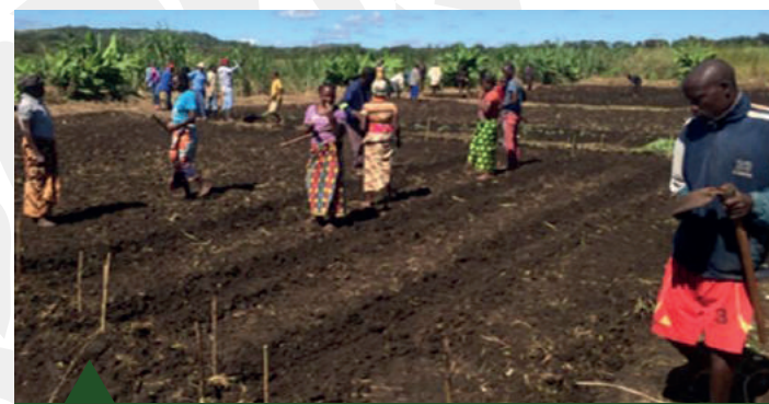
Demarcation of the area and formation of the pilot plant for the sowing, on the basis of the conservationist agricultural practices.