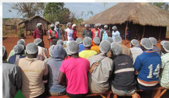
Cooking workshop with preparation of vegetable soup and bean burger.

Technical training was carried out for the implementation of production models based on the Natural Agriculture method, as well as cooking workshops, involving techniques for harvesting, sanitizing, preparing and preserving food.