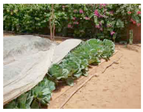
Production of cabbages in the city of Niamey