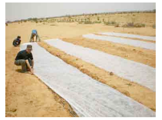
Setting up of veils