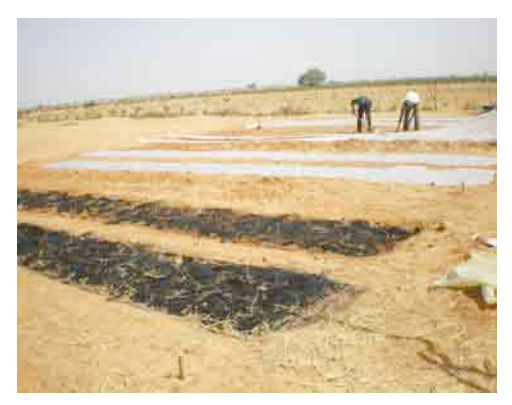
Biochar application in Senegal