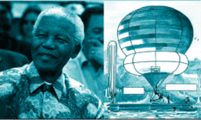
Nelson Mandela Patron Emeritus of the "Peace Parks" Foundation.