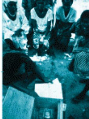
Micro-credit meeting in Akassa.

...with the Akassas, a rural community in Nigeria