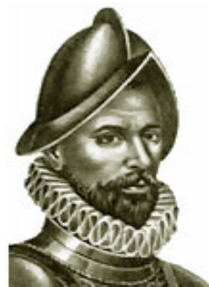
Francisco de Orellana

On 5 August 1495 Christopher Columbus received a rather peculiar letter from Royal Cosmographer Jaume Ferrer de Blanes. Ferrer was writing to inform Columbus of his discoveries in the New World, and in particular the apparent correlation between 'great and valuable things' and 'hot regions inhabited by darker skinned peoples.' He continued, 'and therefore, in my judgement, until Your Lordship meets such peoples, You shall fail to find an abundance of such things.' Seduced by the prospect of treasure, on his next voyage across the Atlantic Columbus turned sharply towards the equator, discovering South America. The consequences of Ferrer's flawed logic would transform the face of the world, and the entire way of life for indigenous Amerindians.