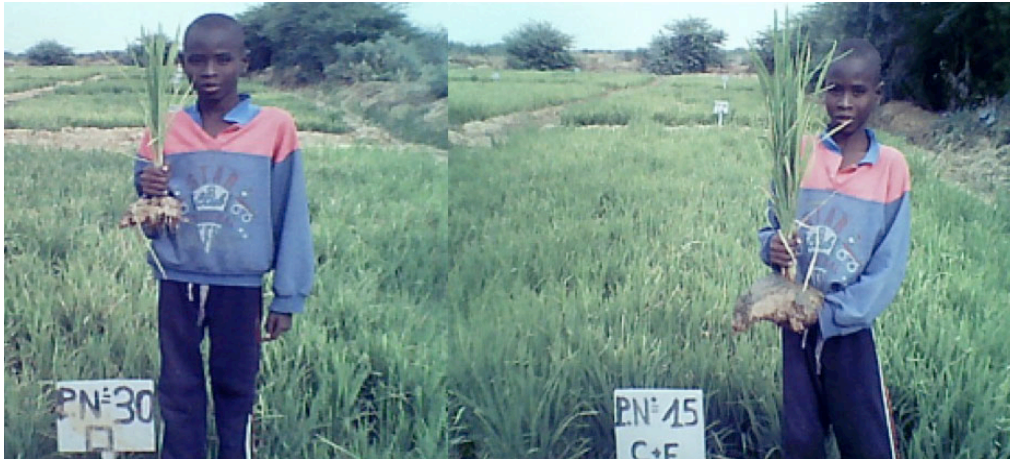
Rice without biochar in Northern Senegal

This is no easy task, but it is worth attempting. As summarised by scientist James Lovelock, author of 'The Gaia Theory', 'There is an outside chance that one procedure could really turn back the clock on Global warming and that is burying carbon. All you have to do is get every farmer everywhere to make a profit by turning all his agricultural waste into char and burying it.'