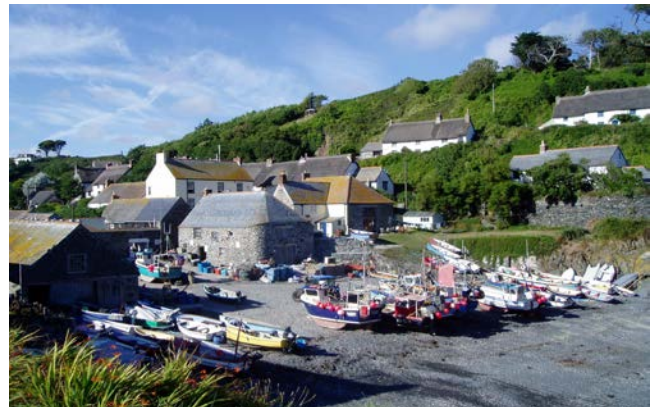
Fishing, a traditional Cornish way of life

7. The globally recognised status of a National Park would provide increased opportunities to recognise and understand the distinctive character of the landscape especially the unique Cornish culture and heritage found within its boundaries, the Cornish having been designated a 'minority status group' in 2014 under the European Framework Convention for the Protection of National Minorities.