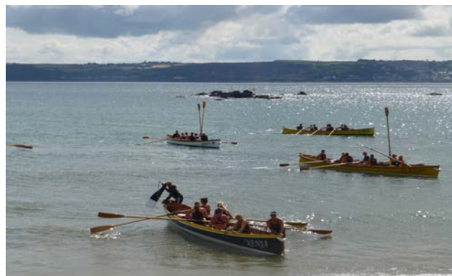
Racing of pilot gigs, a traditional Cornish sport

It is of note that the UK Government's National Planning Policy Framework (2012) states, 'great weight should be given to conserving landscape and scenic beauty in National Parks, the Broads and AONBs, which have the highest status of protection in relation to landscape and scenic beauty.' The Joint Nature Conservation Committee, the public body that advises the Government on nature conservation states, 'AONBs have equivalent status to National Parks as far as conservation is concerned' ( jncc.defra.gov.uk ).