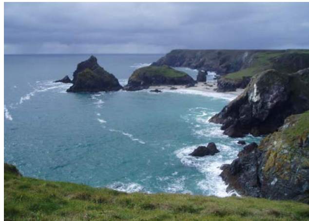
Spectacular cliffs typical of the Cornish Coast

The Cornwall AONB, created in 1959, has a continuous coastal footpath and is a major asset for the local economy attracting millions of visitors and locals. The area is managed through a 'management plan' by a small team of officers (the AONB Unit) and a 'partnership' consisting of local elected representatives, business people, representatives of designated agencies (e.g. Natural England) and local non-government organisations (e.g. Wildlife Trusts). This partnership is currently in the process of establishing a new organisation, a 'Charitable Incorporated Organisation' with appointed trustees to provide a legal independent entity to complement their work (see cornwallaonb.org.uk ).