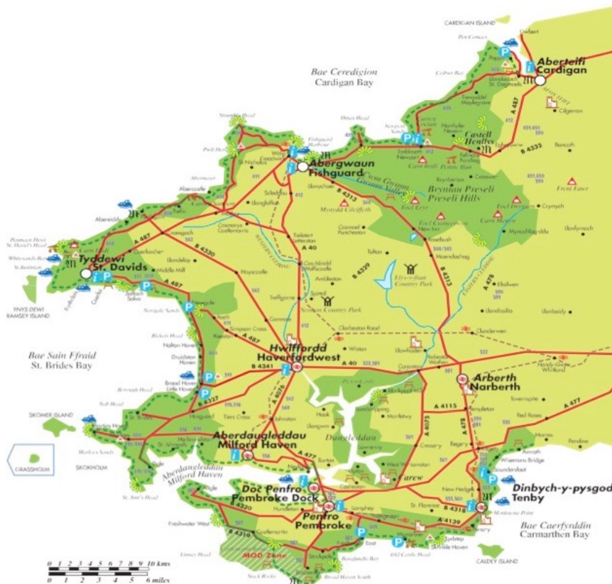
Map from Pembrokeshire Coast National Park Authority - see pembrokeshirecoast.org.uk

In the 1950's a geographical area similar to the Cornwall AONB was made into a National Park with the designation of the Pembrokeshire Coast National Park in Wales (the darker green shows the Park area).