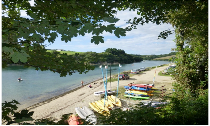
Leisure activities are part of the economy in the AONB

4. The 15 National Parks are funded by the UK Government via DEFRA (the Department of the Environment, Food and Rural Affairs) to a total of c. £75.03 million annually (2012-13). In contrast the 46 AONBs (of England, Wales and Northern Ireland) are funded by a combination of national (75-80% via DEFRA) and local sources (20-25%) receiving a total of c. £6.6 million from DEFRA to English AONB Partnerships in 2013 (a further £10.2 million was generated from other sources such as Local Authorities, Heritage Lottery Fund, European Union and business sponsorship).