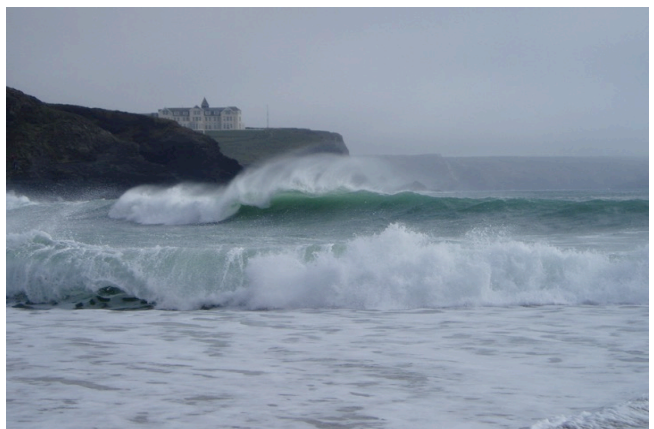
The breath-taking coastal scenery of Cornwall

Despite this, the Hobhouse Report (1947) excluded Cornwall from the list after careful consideration, stating: 'the reason is not because we regard the scenic quality and recreational value of the Cornish Coastline as falling short of National Park standards – on these grounds it fully deserves its selection – but on account of serious administrative difficulties in the way of its treatment as a National Park . . . Even so we should not recommend its omission from our selection of National Parks except on the supposition that an alternative method of conservation will be made available under the Conservation Area scheme...'