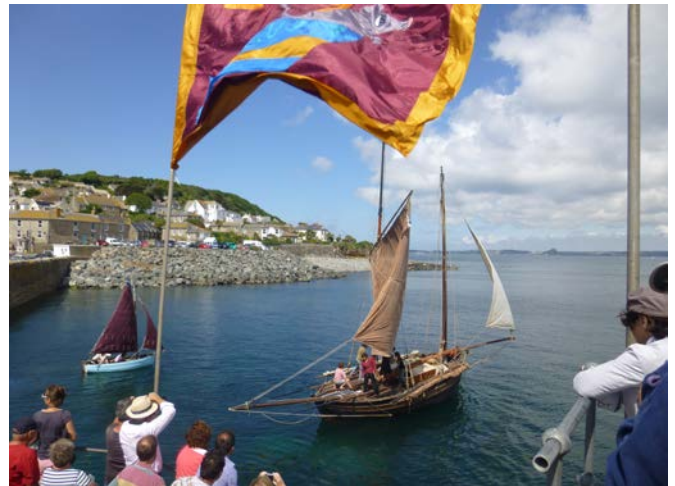
A village festival of traditional boats

Similar to all beautiful areas whether designated as an AONB, a National Park or just magnificent to look at and live in, there are potential downsides in the form of high house prices, pressure to build, increased migration, high visitor numbers and development at the edges. However, it can be argued that most of the potential downsides to creating a National Park are already with us in Cornwall (one of the fastest growing areas of the country) and are likely to continue. Nonetheless there are many specific advantages to establishing a National Park Authority for Cornwall as outlined above.