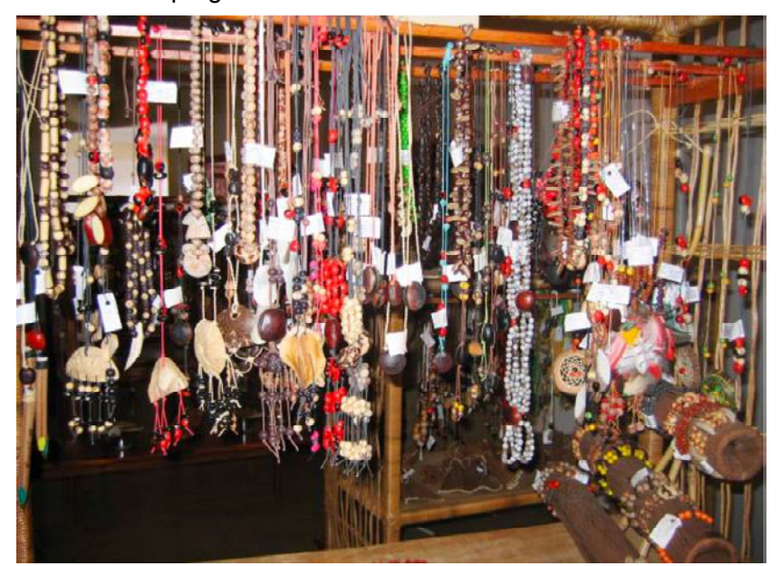
House of Handycraft in Macapa, a shopwindow for selling Amapa productions

Thanks to the support of the Cartier International Group and in the context of the Council for Responsible Jewellery Practices<sup>1</sup>, Pro-Natura and the Brazilian association Natureza da Amazônia run an integrated development project for the benefit of resident populations of the National Park of Tumucumaque in the north of the Amapa state. Adjacent to the new National Amazonian Park of French Guiana, it is the largest national reserve in the world. The overall aims of the project are to improve the living conditions of the communities by proposing economic alternatives to gold washing and to promote sustainable management of natural resources. The activities of the project relate to four key domains: health, agroforestry, handicrafts and eco-tourism. With the support of the Cartier International Group, Pro-Natura organizes training on bio-jewel making for women's associations, in collaboration with the Amapa government and the Natureza da Amazônia association.